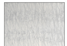
CORRECT APPLICATION = 20 dry gms/sqm