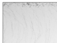
COVERAGE TOO LIGHT